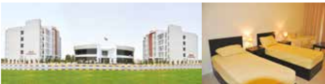
EDRAK Residential Halls for students

The program is focused on promoting the acquisition of expertise, attitude and behaviour that facilitate effective and appropriate interaction with patients and colleagues. Its goal is to produce caring, knowledgeable, competent and skilful oral specialists who recognize and accept the obligation to practice in the best interests of patients at all times.